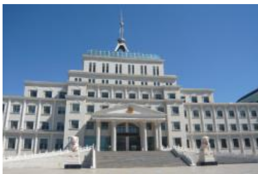
the police station

We started out from Yinchuan, just across the border of Inner Mongolia in Ningxia. It has the nearest airport to Bayan Hot, the capital of Alashan Prefecture of which Ejina Qi is a part. One morning in Bayan Hot we went to the police station to apply for a travel permit. We arrived just before opening hours and the morning ritual surprised us. Hundreds of police lined up in the inner courtyard, surrounded by grand buildings. Solemn music started, heroic and melancholy, and with a Russian touch to it. It was moving and at the same time almost made me laugh.