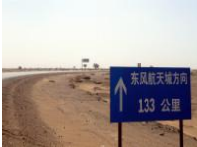
133 km to the 'East Wind' Launch Site

Another visit to a police station. Another plea to travel directly to Jiuquan, using the road past the 'East Wind' site. Six seven nervous officers came to see us. There was no way. The site was in a military region, police had zero authority there. They would likely get in trouble if they told us we could go.